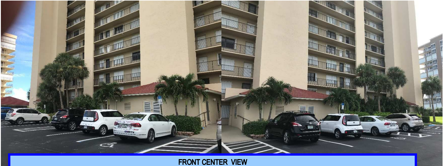
FRONT CENTER VIEW