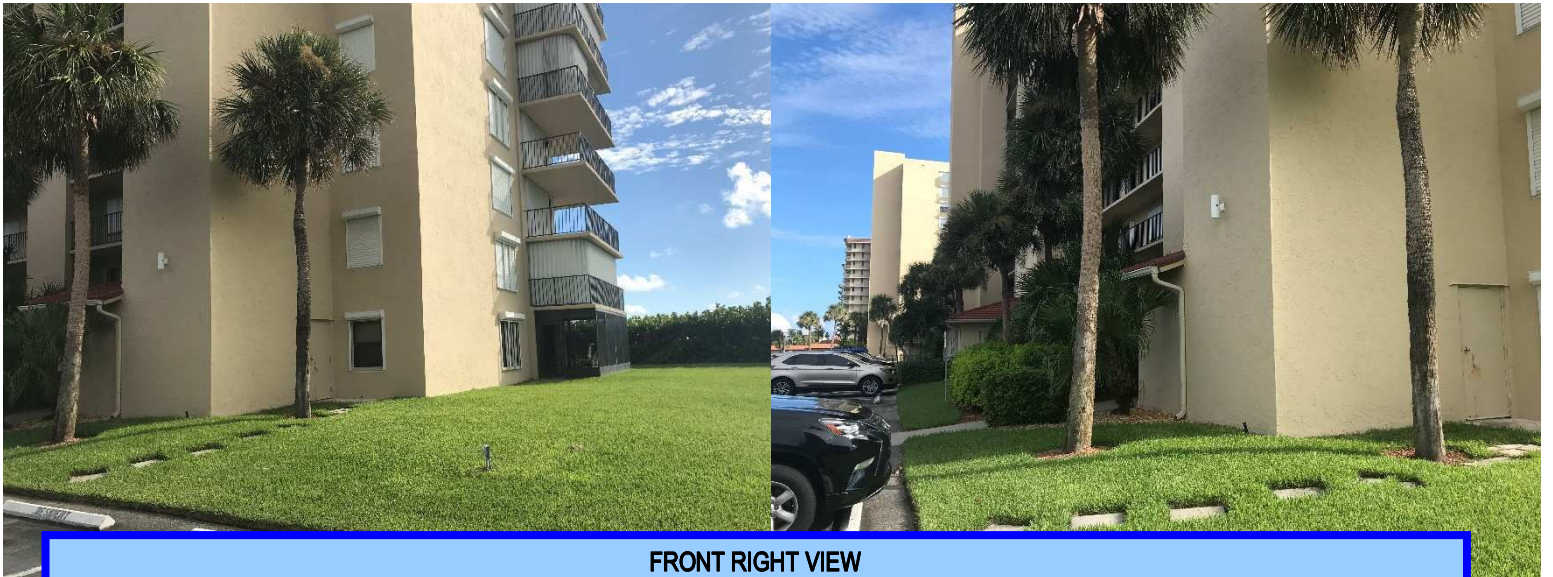
FRONT RIGHT VIEW