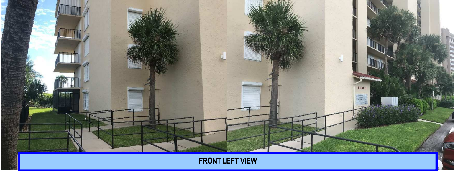
FRONT LEFT VIEW