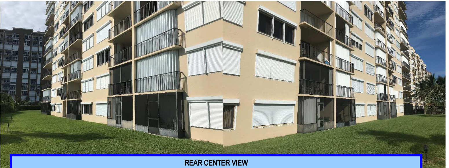
REAR CENTER VIEW